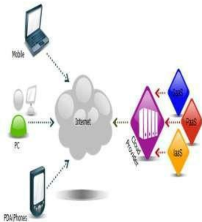
Fig 3: Cloud Computing Concept

The Fig. 3 shows that how different users can connect to the cloud services provided by various service providers by using any device over the internet. Cloud infrastructure includes scalable resources in terms of storage, network, and compute. It also contain virtualized infrastructure